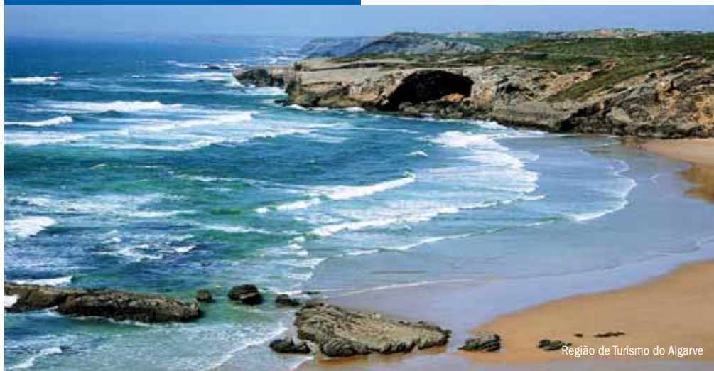
Região de Turismo do Algarve

The international airport in Lisbon offers connections to all of Europe's major cities as well as Portugal's paradise islands in the Atlantic. It's only a two-hour flight from Lisbon to the Azores or to Madeira island, often called the "floating flowerpot" for its variety of lush vegetation.