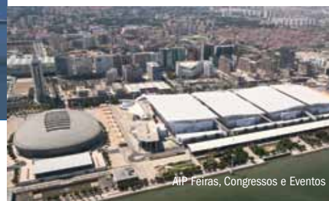
AIP Feiras, Congressos e Eventos